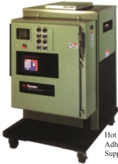
Hot Melt Adhesive Supply Unit